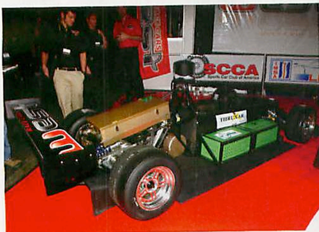
Is this the new face of racecars? West is banking on it.

For more information on The Driving Zone , visit www.andypilgrim.com . To get details on the Shriners Automotive Safety Project go to www.shrinershospitals.org .